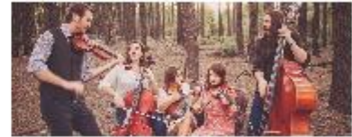
RUN BOY RUN MONDAY, FEBRUARY 8