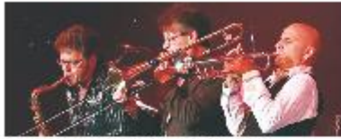
BRASS TRANSITI: THE MUSIC OF CHICAGO FRIDAY, JAN 29

19 performances conveniently located in and around North Scottsdale