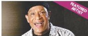
AL JARREAU FRIDAY, FEB 5