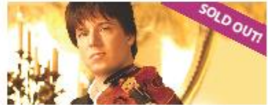
JOSHUA BELL with the FESTIVAL ORCHESTRA THURSDAY, FEB 25