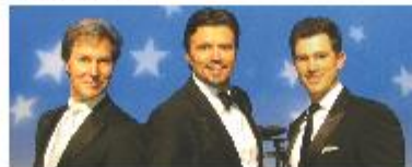
THE BROADWAY TENORS SUNDAY, MARCH 6