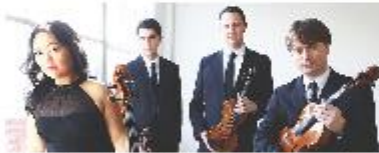
CALIDORE STRING QUARTET THURSDAY, FEB 18