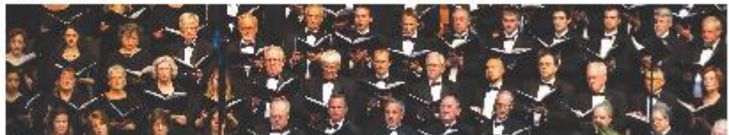
CARMINA BURANA SUNDAY, FEB 28 A triumphant masterpiece featuring the Arizona Musicfest Festival Orchestra, Festival Chorus, Phoenix Girls Chorus and Solists