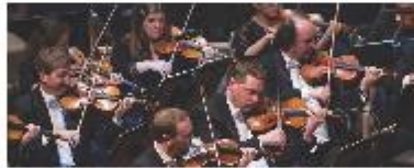
MOZART'S 25TH & MAHLER'S "TITAN" TUESDAY, FEB 23