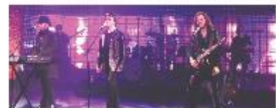
THE AUSTRALIAN BEE GEES FRIDAY, MARCH 11

480.840.0457 • 25th Anniversary Season • azmusicfest.org