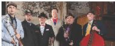
DUKES OF DIXIELAND THURSDAY, MARCH 3