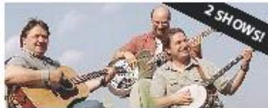
KRUGER BROTHERS IN CONCERT SATURDAY, FEB 13