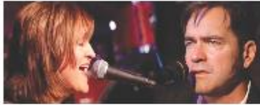
YOU'VE GOT A FRIEND FRIDAY, FEB 12 THE MUSIC OF CAROLE KING & JAMES TAYLOR