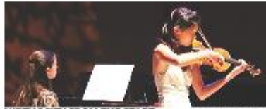
VIRTUOSITY FROM THE START: YOUNG MUSICIAN CONCERT SUNDAY, JAN 31